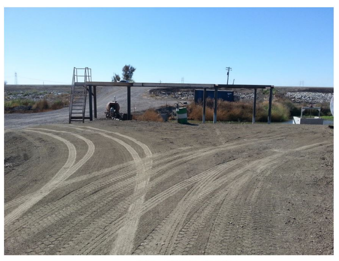
LOOKING WEST TOWARDS THE PROJECT