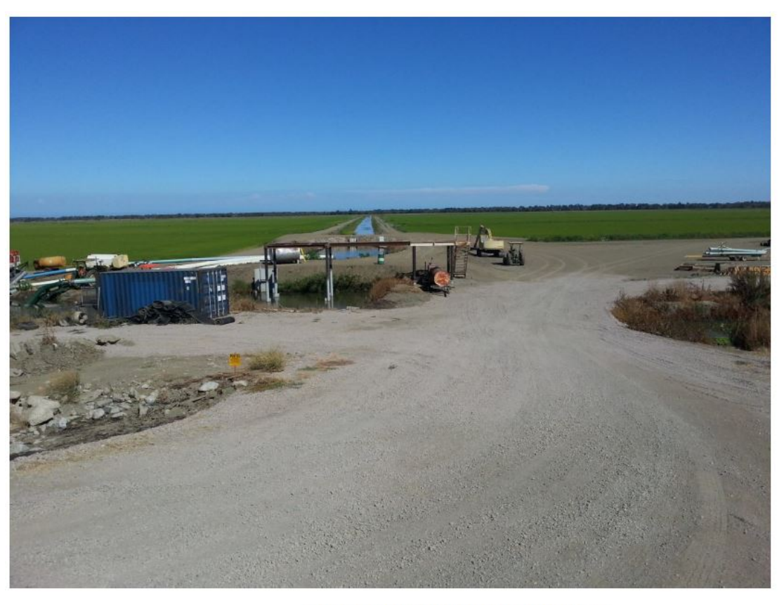
LOOKING EAST FROM YOLO BYPASS WEST LEVEE