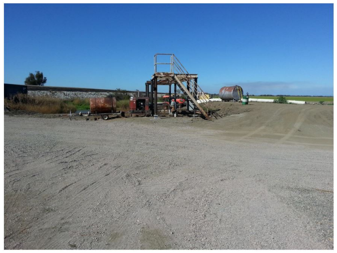
LOOKING NORTH TOWARDS THE PROJECT